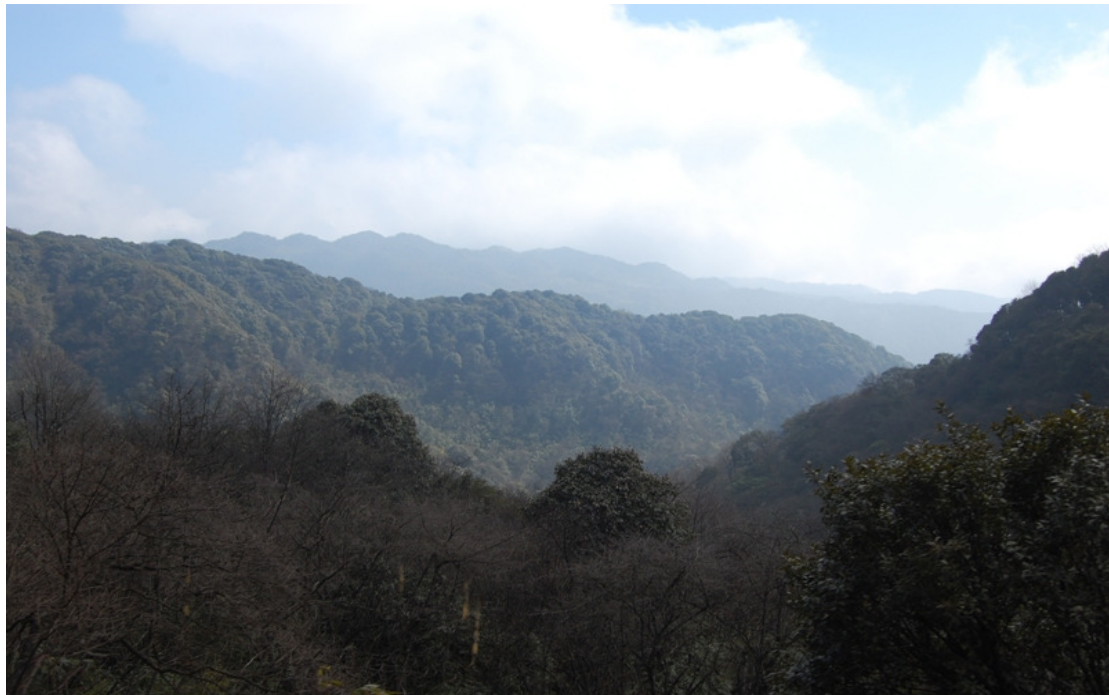
Jinfo Shan Nature Reserve (CN229) is an area of subtropical forest in the eastern part of the Sichuan basin, which supports rare relict plants such as Yin Shan Cathaya argyrophylla and Dove Tree Davidia involucrate .

Key: ● = Protected; ● = Partially protected; ○ = Unprotected.